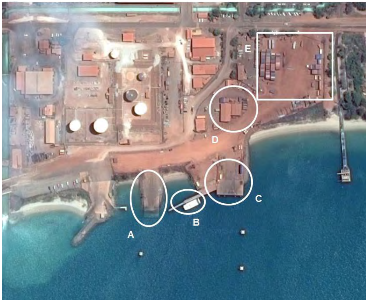
Diagram of Gove Wharf